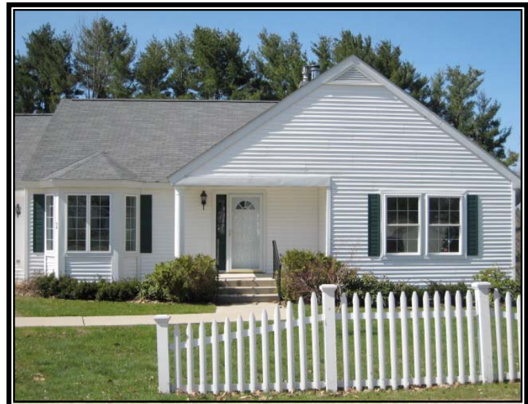
Cottage # 2