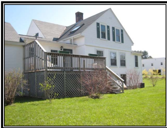
Cottage # 2

Enjoy the great outdoors from your private back deck. Hassle free lawn care as well as a beautiful perennial garden when in bloom.