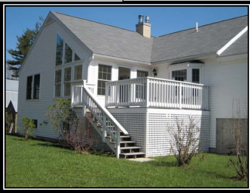
Cottage # 1

Living in the Cottages at Woodcrest Village removes the burden of home management and maintenance, and provides peace-of-mind and complete relaxation.